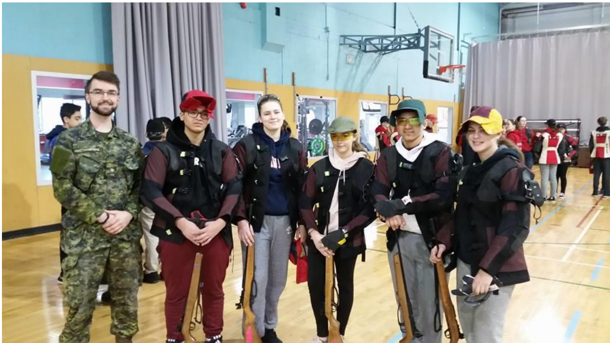
(Marksmanship Team at Regionals in CFB Trenton – 13-15 April 2018)